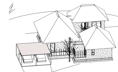
2 NORTH WEST VIEW