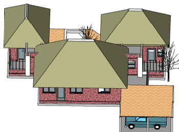
4 NORTH VIEW